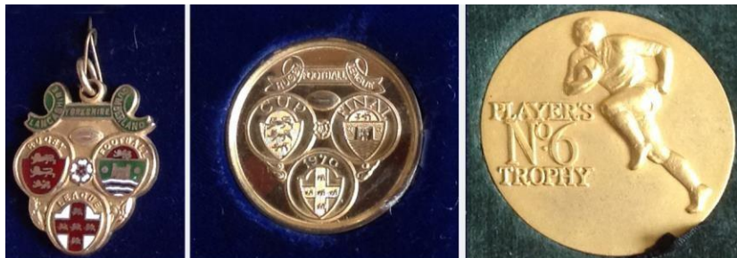
1969 Challenge Cup Winners' Medal